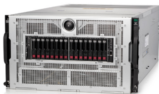
FIGURE 1. HPE Apollo 6500 Gen10 Plus System