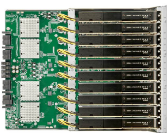
FIGURE 4. AMD Instinct MI100 GPU with Infinity Fabric™ Link

Yet modern AI workloads are already pushing the boundaries of accelerated computing. Now, savvy organizations are looking for cutting-edge solutions to unleash the full power AI, gain competitive advantage, and solve some of the world's biggest problems.